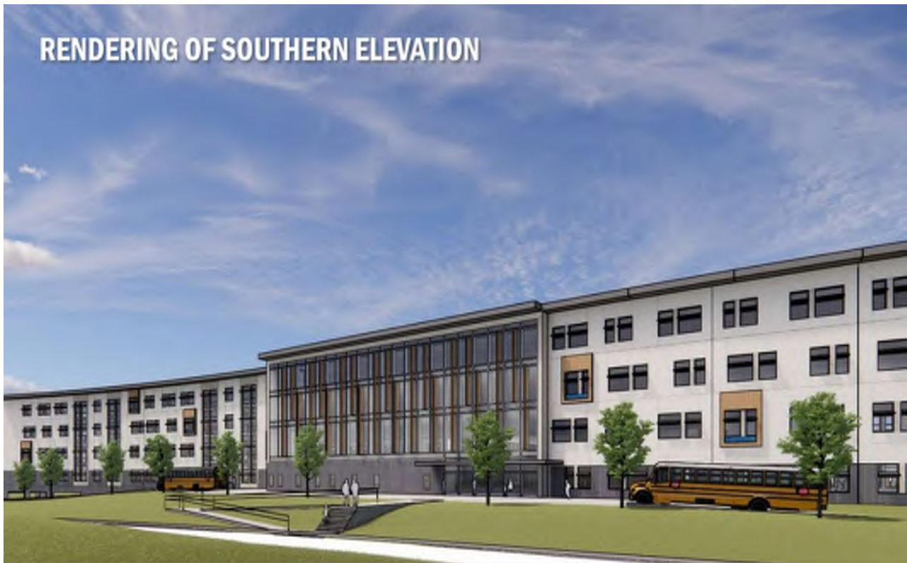
View from Veterans of Foreign Wars Parkway

June was also the month for further discussions with the Focus Group on Exterior Finishes. During the June 23 SBC Meeting, the Design Team presented updated conceptual renderings of the exterior of the building. Additional exterior material options based on discussions regarding the exterior of the Auditorium were presented.