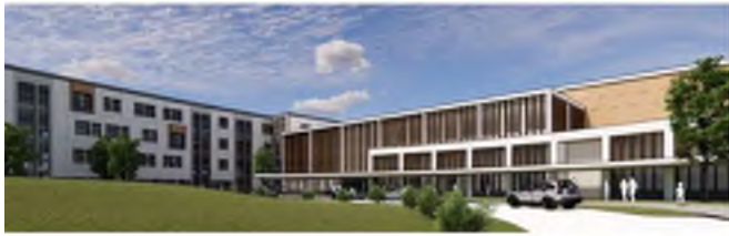
WOOD PHENOLIC PANELS