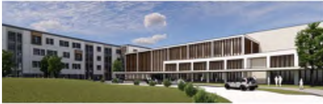
LIGHT GRAY BRICK